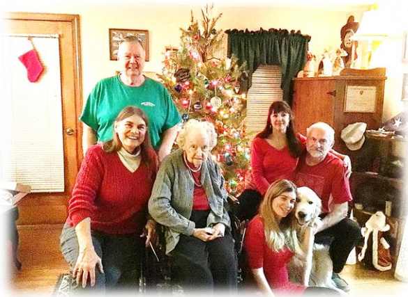
The Cavender family