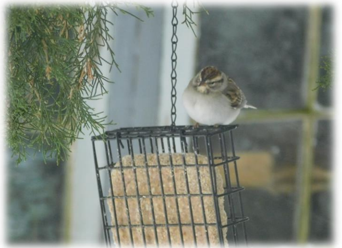
Enjoying God's creations