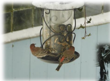
Feeding the birds